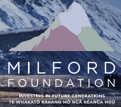
Photo of Lake Tekapo